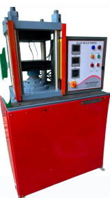
Slab Curing press