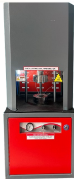
Oscillating Disc Rheometer