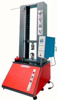
Universal Tensile Machine